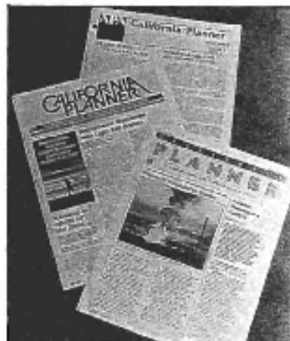
The look and content of California Planner has changed throughout the years.

"...The best analogy to explain the five-year effort that culminated in AB2038 is a tree in a windstorm. A sapling, as it grows, resists the wind's damage by bending with the storm. It branches out, gathers girth and, in time, spreads a crown that makes it vulnerable to storm damage... wise husbandry calls for selective pruning, keeping the important limbs and removing excessive and unproductive